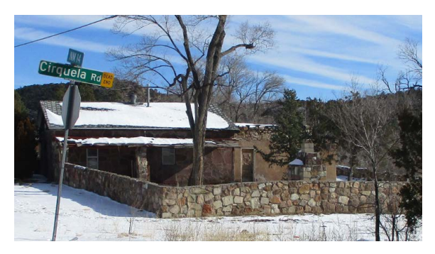
Stone House view from Cirquela Road after grounds clean-up in January.

The historic house was built on land purchased in the 1880s by Charles Campo. At various times, it has included a bar, store and post office. Campo made wine from locally grown grapes and kept it in large wine barrels in the cellar. Above the cellar was a dance hall and kitchen. In 1930, Dulcinea and Flaviano Sanchez moved into the stone house, a few weeks after their marriage. They held fiestas, weddings and occasional Saturday night dances in the hall until it was partially destroyed by a car that veered into it from the road. The dance hall was torn down in the mid-1940s. Dulcinea, who was an honorary EMHS member, liked to tell fellow members about her basement's moonshine still.