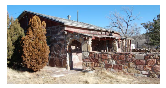
Stone House view from NM 14 in January.

Today, the property needs a tremendous amount of work. Windows and walls are broken, large portions of the roof are missing and it lacks working utilities. It does have a historic acequia ditch on the property, quite a bit of outdoor space, including land that could be used for parking, and a courtyard where EMHS could host fundraisers. Its location on North 14 is prime.