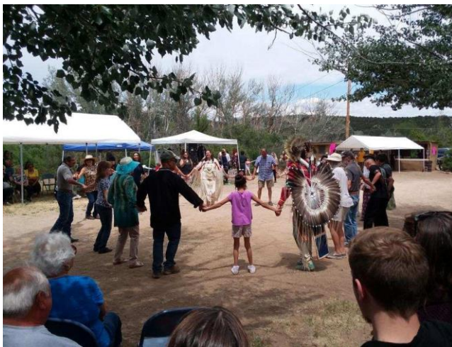
Community members joined dancers at the San Antonio bicentennial fiesta in June.