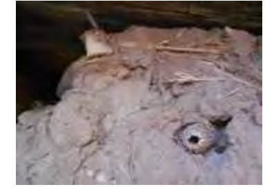
Old adobes contain on-site clay, straw, bones and corn cobs.

an old map as having been a fort, and some say the wall might have been part of a remount station.