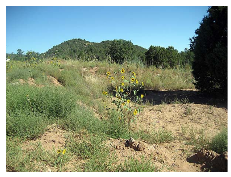
A view from the trailhead at John A. Milne Gutierrez Canyon Open Space in Cedar Crest, acquired by the City of Albuquerque through the work of a coalition that included the East Mountain Historical Society.

The former school is located on the east side of North N.M. 14, just north of Frost road, across from the school bus yard. For maps and information on the Enchantment tour, visit <u>http://www.home-sofenchantmentparade.com</u>. For more on the school, check out the story we ran in 2007 by clicking on "2007 Issue 2" on the <u>Newsletters page</u> of the EMHS Web site.